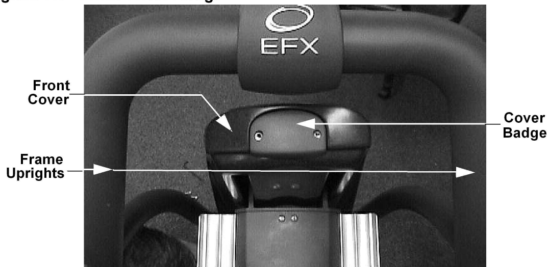
Diagram 7.1 - Front Cover Badge